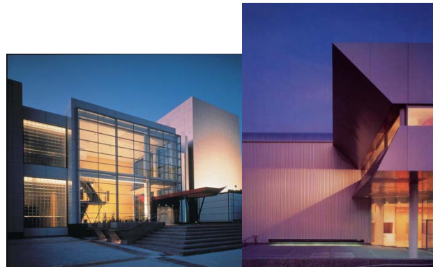
Yerba Buena Center for the Arts