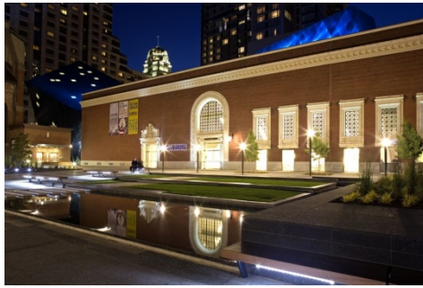
Jessie Square Plaza at Night