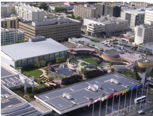
Aerial of the Children’s Garden