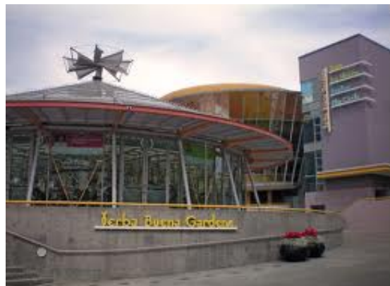
Children’s Creativity Museum Carousel