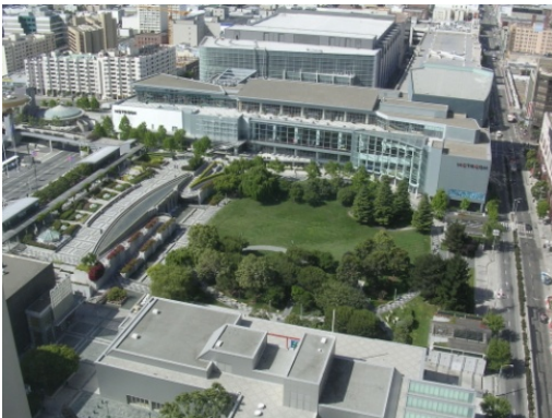
Aerial of Yerba Buena Gardens Open Space